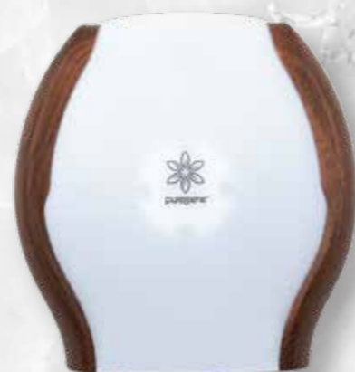
Jumbo Toilet Roll Dispenser