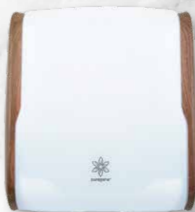
Slimline Hand Towel Dispenser