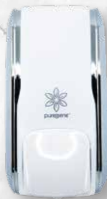
Foam Soap Dispenser *