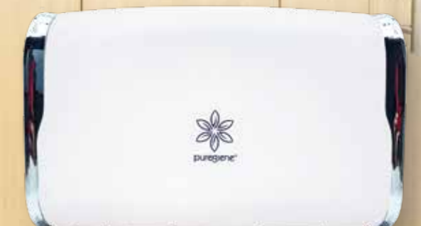
Compaq Duo Toilet Roll Dispenser