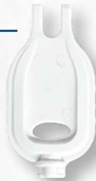
the tissue roll