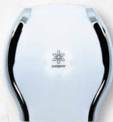
Jumbo Toilet Roll Dispenser