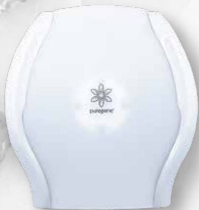
Jumbo Toilet Roll Dispenser