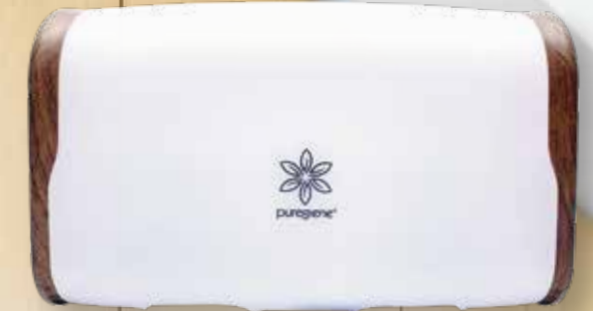
Compaq Duo Toilet Roll Dispenser

SPACE SAVING, HIGH CAPACITY TOILET ROLL DISPENSER