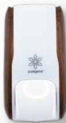
Foam Soap Dispenser *