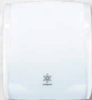
Slimline Hand Towel Dispenser