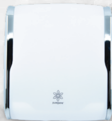
Slimline Hand Towel Dispenser