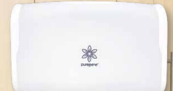
Compaq Duo Toilet Roll Dispenser