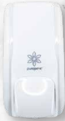
Foam Soap Dispenser *